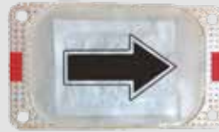
CUSTOM PRINTING AVAILAIBLE