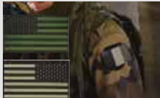
IFF SHOULDER FLAGS