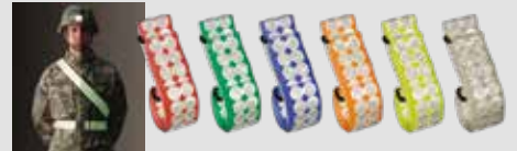
PT BELT™ PERSONAL MARKER BELTS