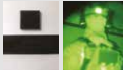
IR ROLLS & SQUARES